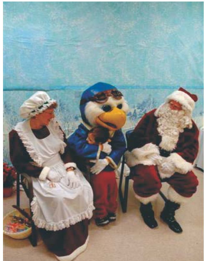
A Detroit visitation was made complete when Captain Baldy was joined by Santa and Mrs. Claus.

Detroit "Pilots for Kids" members visited over 200 kids in visits to Mott's Children's Hospital in Ann Arbor and Barnum Rehabilitation Center of Beaumont Hospital in Royal Oak. Along with the pilots, we had Captain Baldy accompany us to both hospitals. He brought with him a special gift that he left behind to help them during their hospital stay. Captain Baldy brought his 14" mentor, an exact replica of himself. The kids all wanted a picture with themselves, Captain Baldy and their new best friend, the Captain Baldy doll. He was a big hit. We would like to thank all those who donated their time or money to enable us to bring smiles to the children and their families during a trying time for them during this holiday season.