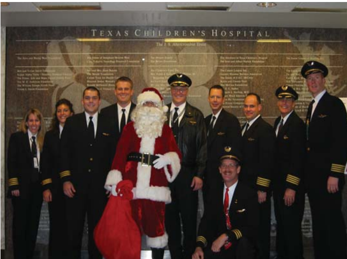
Continental and ExpressJet crew members were joined by Santa in their visit to Texas Children's Hospital in Houston.

Continental and ExpressJet pilots spent time spreading holiday cheer on December 3rd at Texas Children's Hospital in Houston. Santa was able to take time from his busy schedule and help deliver several cart loads of PFK plush bears to the children. A wonderful time was had by all.