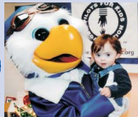
PFK Mascot, Capt. Baldy

The Pilots For Kids logo is a registered trademark. The name "Pilots For Kids" and the Pilots For Kids mascot character are protected trademarks and/or servicemarks (SM) of the Pilots For Kids, Inc.