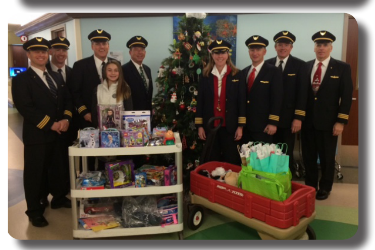
Above, nearly forty PFK volunteers spread cheer to youngsters at four Washington, D.C. area hospitals.