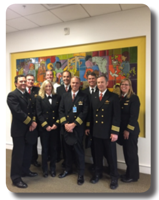
Left, SLC PFK volunteers again visited The Children's Center to spread holiday cheer. Look for another event in September from this group!

Close to 40 pilot volunteers helped make this season brighter for nearly 200 hospitalized children!!