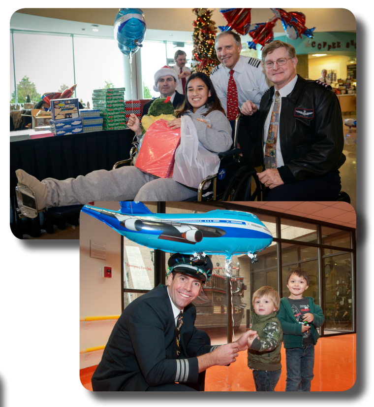
Above, DFW volunteers sharing holiday joy!

Below and left, ANC volunteers distributed over 200 gifts as they visited two hospitals and a local emergency shelter.