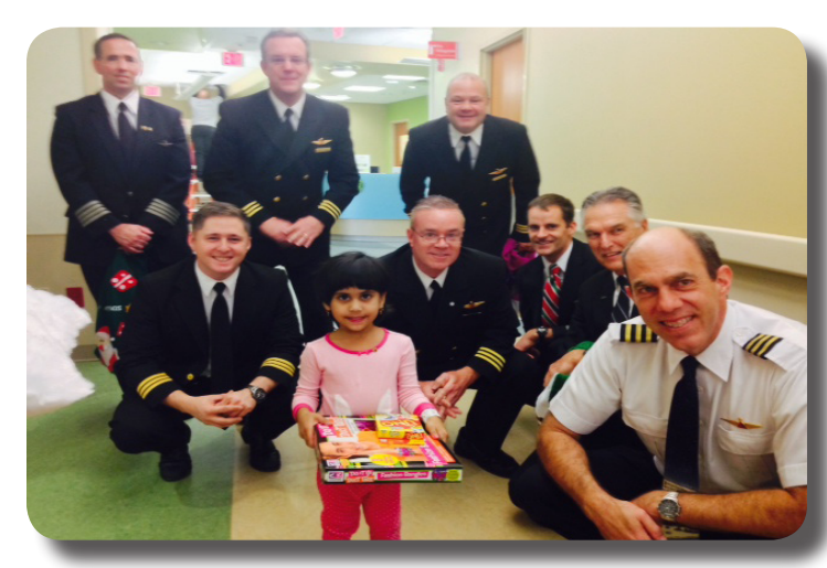
Above, PFK volunteers again visited children at WakeMed Children's Hospital. It's easy to see that the volunteers enjoyed the visits as much as the young patients.