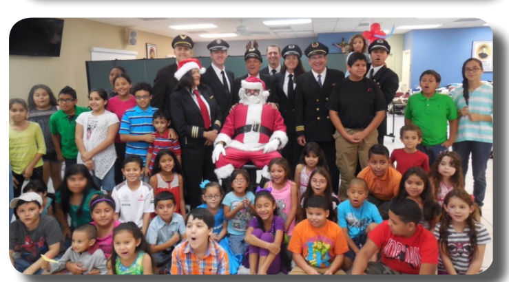
Above, PFK volunteers from MIA held their annual holiday event for 70 youngsters and their families. Santa, SpiderMan, a clown and several elves were able to join in the fun. Right, ORD volunteers brightened the holidays at 3 locations.