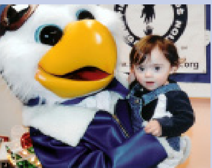
PFK Mascot, Capt.Baldy

The Pilots For Kids logo is a registered trademark. The name "Pilots For Kids" and the Pilots For Kids mascot character are protected trademarks and/or servicemarks (SM) of the Pilots For Kids, Inc.