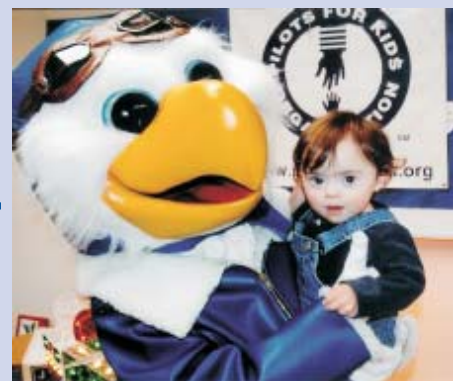
PFK Mascot, Capt. Baldy

The Pilots For Kids logo is a registered trademark. The name "Pilots For Kids" and the Pilots For Kids mascot character are protected trademarks and/or servicemarks (SM) of the Pilots For Kids, Inc.