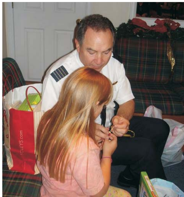
UAL pilot on a Denver visit