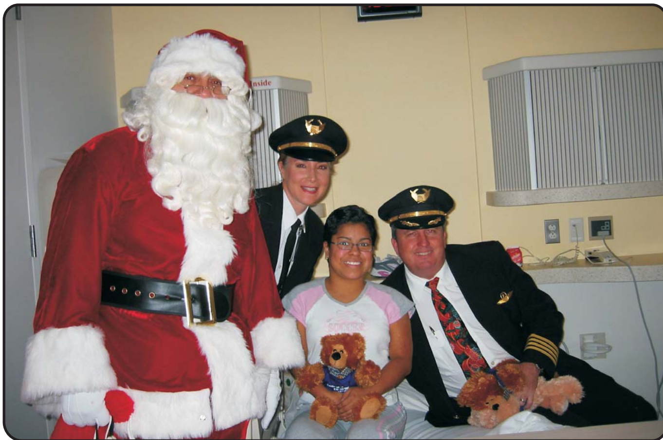
Continental Airlines crewmembers & Santa on a Houston visit.