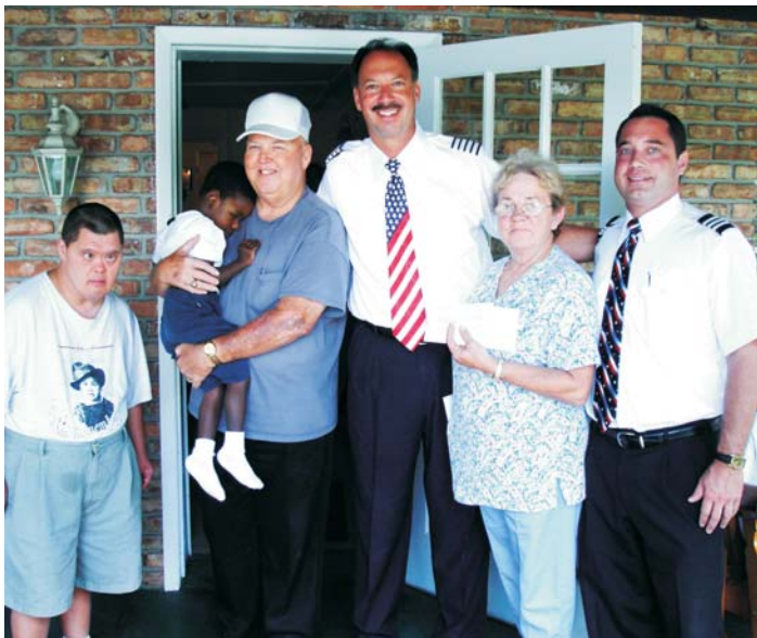
Southwest pilots presenting a gift of $15,000.00 to the Russell Home