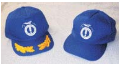
Ball caps $7.50 & $10.00