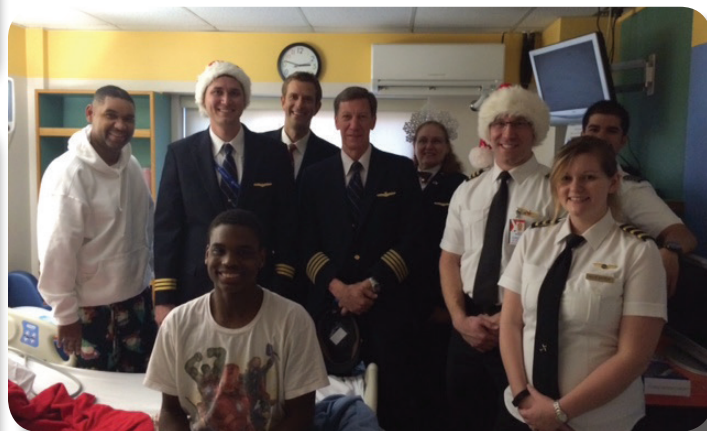
Above and below, PFK volunteers from IAD showed their holiday spirit by visiting youngsters at four local hospitals during the holiday season.