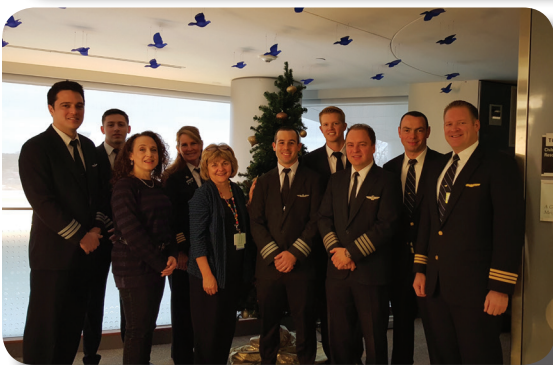
PFK volunteers in ORD made visits to two area hospitals this year.

Address Change: If you have a change of address, you can notify us via the PFK web site or complete the form on the back of this newsletter & mail to: Pilots For Kids, PO Box 620052 Orlando, FL 32862-0052.....Thanks!