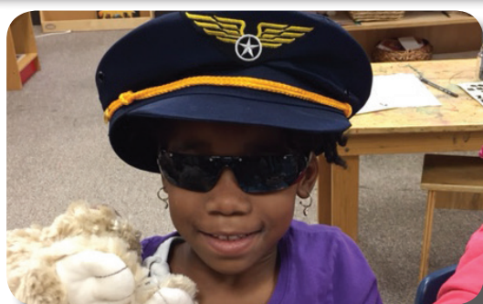
Above and left, PFK volunteers in IND visited three children's hospitals and two pre-school campuses during this years' holiday events. It was unforgettable!