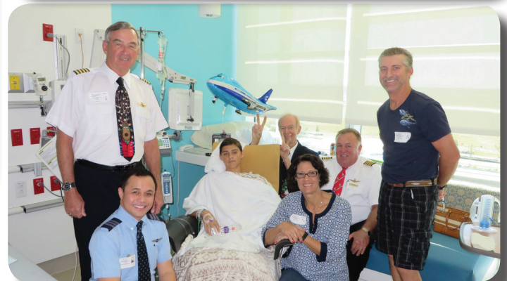
Above and right, PFK volunteers in MCO visited three Orlando area hospitals during the holiday season and brought cheer to a wide variety of children.