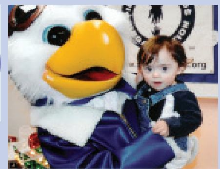
PFK Mascot, Capt. Baldy SM

The Pilots For Kids logo is a registered trademark. The name "Pilots For Kids" and the Pilots For Kids mascot character are protected trademarks and/or servicemarks (SM) of the Pilots For Kids, Inc.