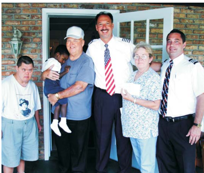
Southwest pilots presenting a gift of $15,000.00 to the Russell Home