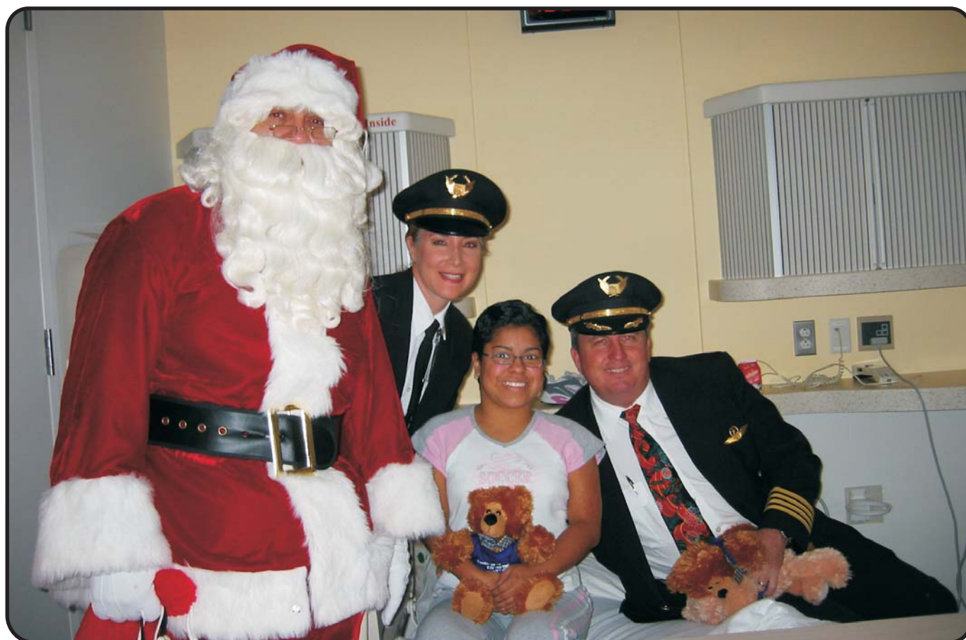
Continental Airlines crewmembers & Santa on a Houston visit.